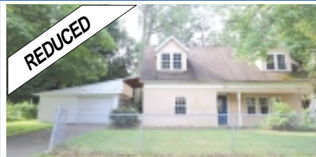
EAST LONGMEADOW $155,700 CHARMING REMODELED 2 level home with 3 beds, 2 full baths, spacious garage with work area. Roomy lot, easy access to main arteries. HUD HOMES . Sold AS-IS.