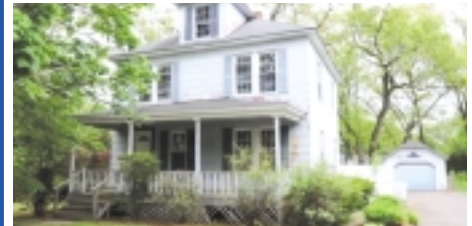
SOUTH HADLEY $146,700 BACK ON THE MARKET! Plenty of room with sparkling hrdwd flrs! Super Colonial, 3 beds, garage, full basement, spacious lot, Central AC! HUD HOMES . Sold AS-IS.