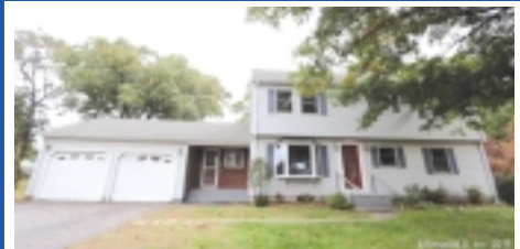
WINDSOR LOCKS, CT $180,000 WHAT A BEAUTIFUL HOME!!! 5 beds, 2 full baths with more room in full basement. Spacious eat-in kitchen, large back deck overlooking in-ground pool with cabana. 2 car attached garage. HUD HOMES . Sold AS-IS.