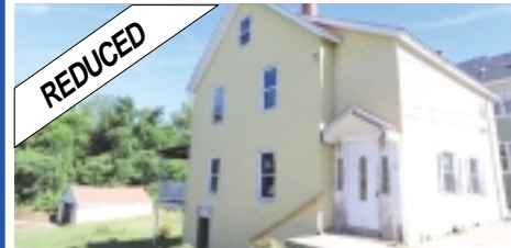
SOUTHBRIDGE $81,823 SUPER SPACIOUS 3 BR home w/large lot & garage! Open floor plan & 3 season porch! Easy access to main arteries! HUD HOMES . Sold AS-IS.