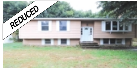
PALMER $143,000 FANTASTIC Raised Ranch on side street! But close to major arteries! 3 bed & 2 full baths including MBR & Mbatb! Level lot & full finished basement! HUD HOMES . Sold AS-IS.