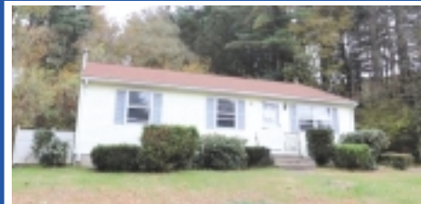
WARE $147,000 ONE-LEVEL LIVING In this Ranch!! Great corner lot. Easy access to main arteries. ful basement, built in 1984, 3 bedroom beauty. HUD HOMES . Sold AS-IS.